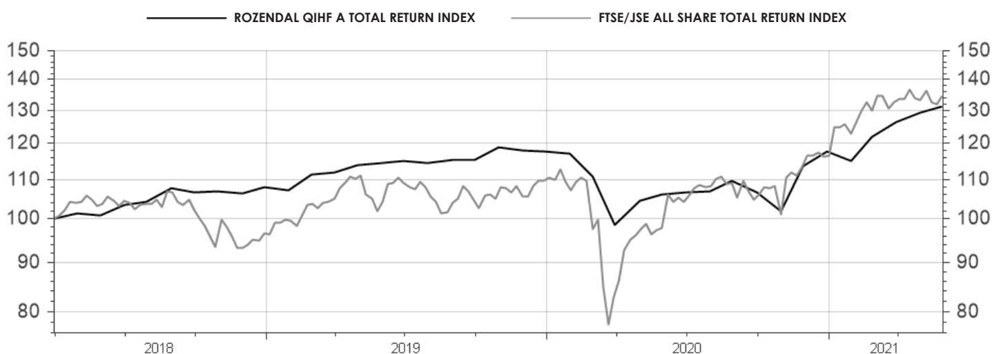
RELATIVE RETURN VS. BENCHMARK (REBASED TO 100)