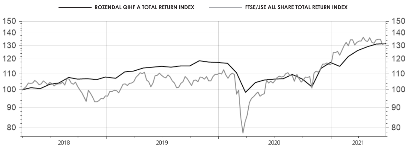
RELATIVE RETURN VS. BENCHMARK (REBASED TO 100)