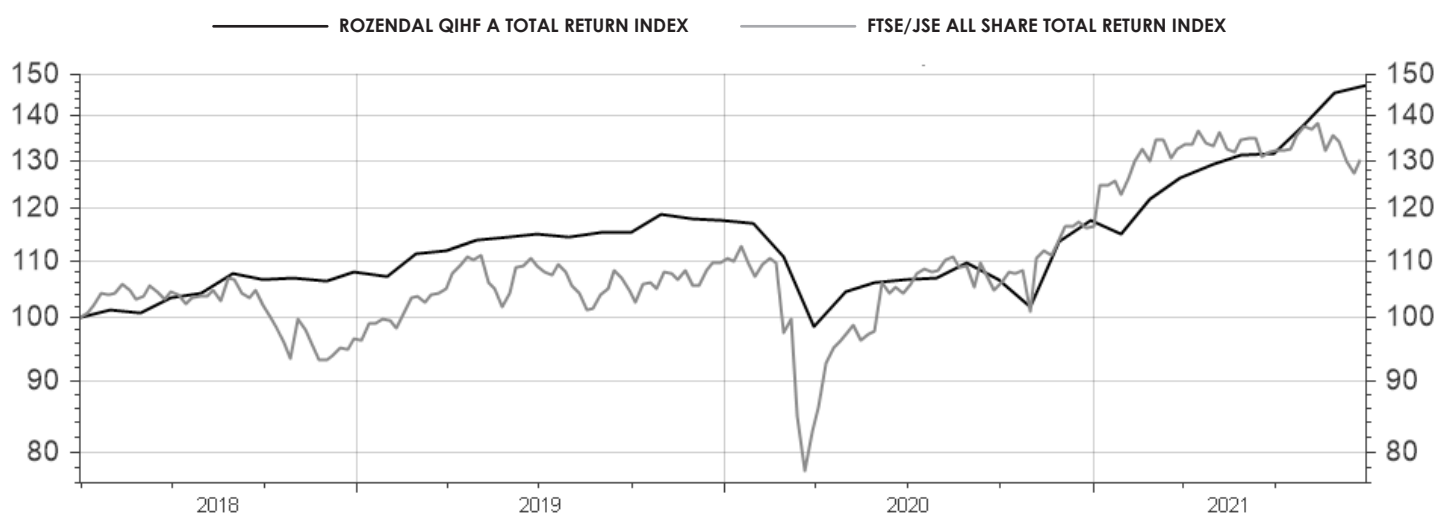
RELATIVE RETURN VS. BENCHMARK (REBASED TO 100)