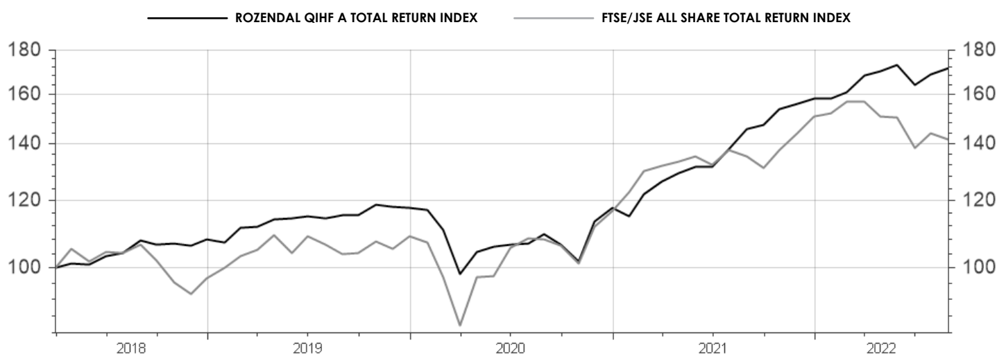
RELATIVE RETURN VS. BENCHMARK (REBASED TO 100)